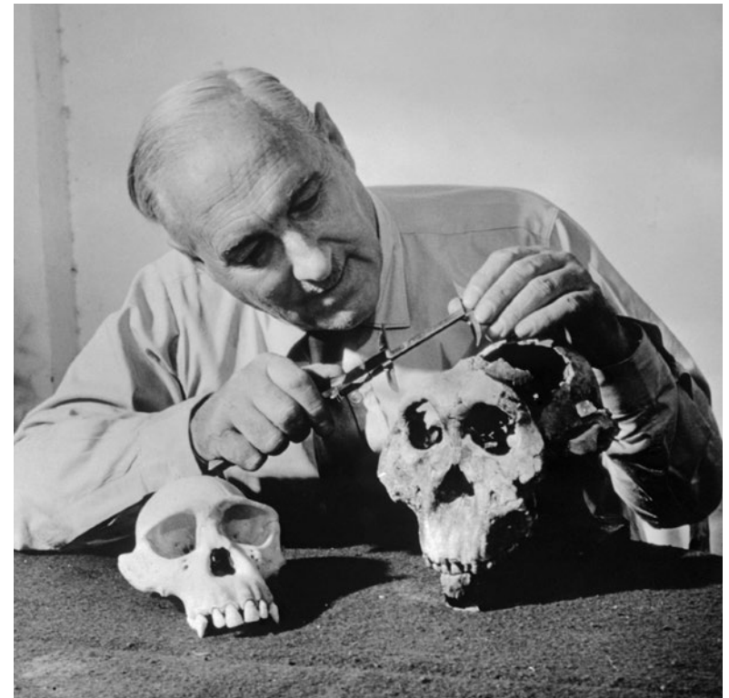
Louis Leakey measures an ancient skull found in Tanzania

What scientists now know took many years to figure out. The first early human fossil bones were found in Europe — Neanderthals in Germany in 1857 and Cro-Magnon in France in 1868. Java Man was found in Sumatra, Indonesia, in 1894. Most paleoarchaeologists in the 1920s and '30s felt certain that Homo sapiens must have evolved in Europe, or possibly Asia, since a group of fossils known as Peking Man was found in China in 1923 — 1927. Africa, widely known then as the “Dark Continent,” was not considered a possibility largely due to racist thinking.