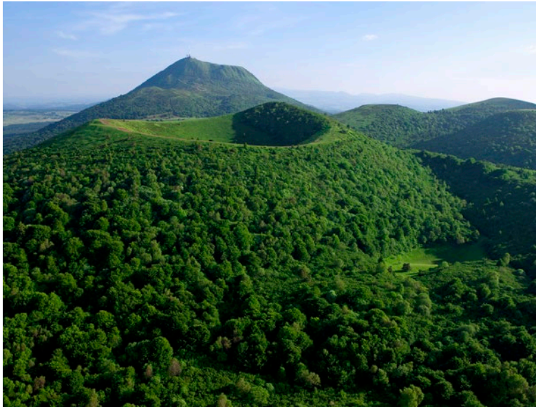
Puy-de-Dôme is one of many dormant volcanos in central France

Teilhard's father was an amateur naturalist who collected rocks, insects, fossils, and plants. His deeply religious mother, the great-grandniece of the eighteenth-century French philosopher Voltaire, instilled in her son a devotion to Jesus. The family lived in the countryside among volcanic mountains and forested hills, and Teilhard grew to embrace both of his parents' greatest interests: love of the Earth and love of the Christian God.