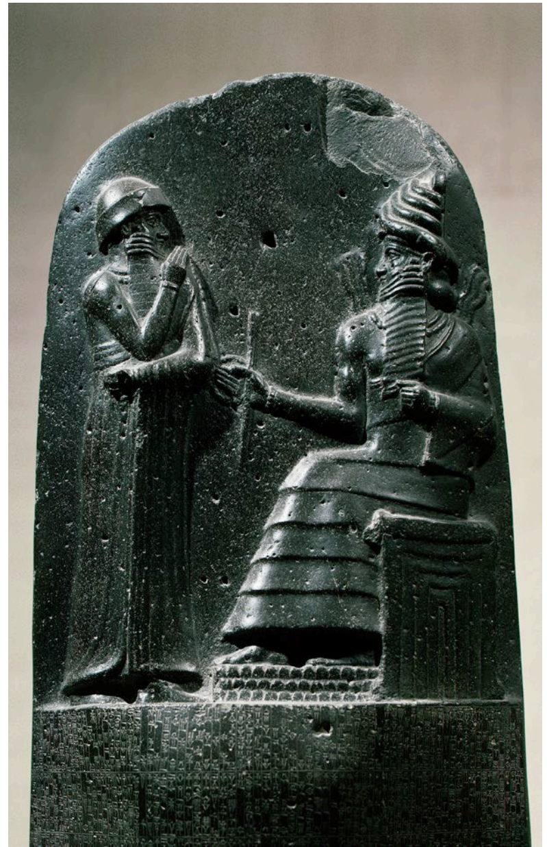
Hammurabi receives the laws from the Mesopotamian deity Shamash

Traditions from southern Mesopotamia also were adopted by Greek scholars. Especially in mathematics, ideas from Mesopotamia persist. Our day is still divided into 24 hours, each hour into 60 minutes, and each minute into 60 seconds. A circle still consists of 360 degrees. Cuneiform writing was used regionally until the beginning of the Common Era, when it disappeared.